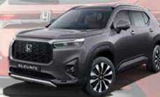
Meteoroid Gray Metallic