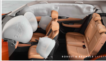
ROBUST & RELIABLE SAFETY