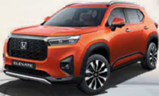
Phoenix Orange Pearl