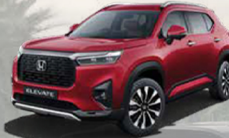
Radiant Red Metallic