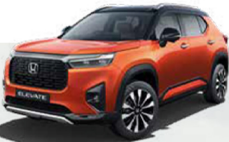
Phoenix Orange Pearl with Crystal Black Pearl Roof