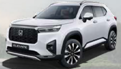
Platinum White Pearl