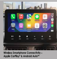
Wireless Smartphone Connectivity - Apple CarPlay ® & Android Auto ™