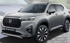
Lunar Silver Metallic