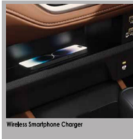
Wireless Smartphone Charger