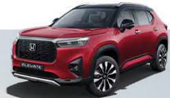
Radiant Red Metallic with Crystal Black Pearl Roof