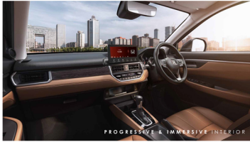
PROGRESSIVE & IMMERSIVE INTERIOR