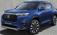
Obsidian Blue Pearl