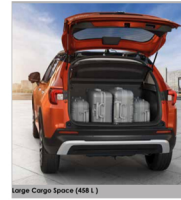
Large Cargo Space (588 L)