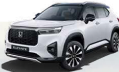
Platinum White Pearl with Crystal Black Pearl Roof