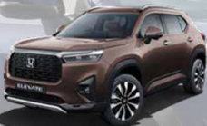
Golden Brown Metallic